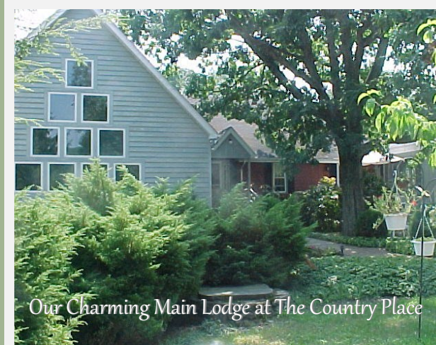
Our Charming Main Lodge at The Country Place