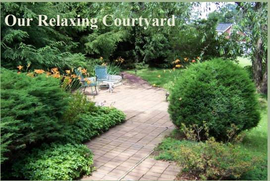
Our Relaxing Courtyard

45 Country Place Lane White Haven, PA 18661