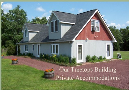
Our Treetops Building Private Accommodations