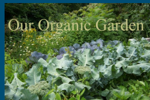
Our Organic Garden